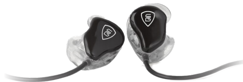
Stage Monitors & Audio Monitors

SoundGear Tunz Audio Monitors have permanently affixed cables designed to hang downward. SoundGear Tunz Stage Monitors may have a removable plug or a permanently affixed one and are designed to wrap around the top and behind the ear. We encourage you to gradually increase your wearing time to become accustomed to the unique sensation of your custom-fit SoundGear Tunz Audio Monitors.